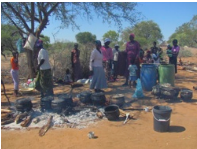
Cooking for the crowd