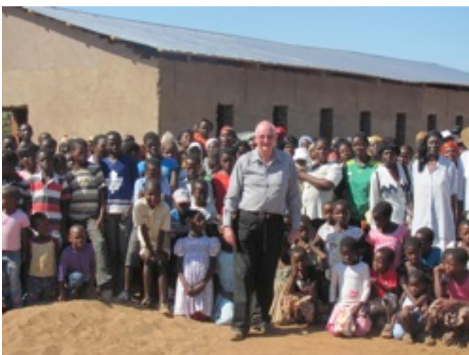
Completed church roof with congregation

'The Body of Christ'. Two new pastors were ordained and there were some notable healings - a frozen shoulder fully mobile, a man with a badly swollen face was normal the next day, heart palpitations were healed - and a demon was cast out.